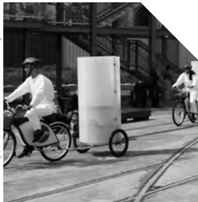
© Fluid City / Water in the sustainability

Space for Life brings the city's Biodôme, Insectarium, Botanical Garden, and Planetarium together, transforming them into a major integrative and participatory space dedicated to the relations between humankind and nature.