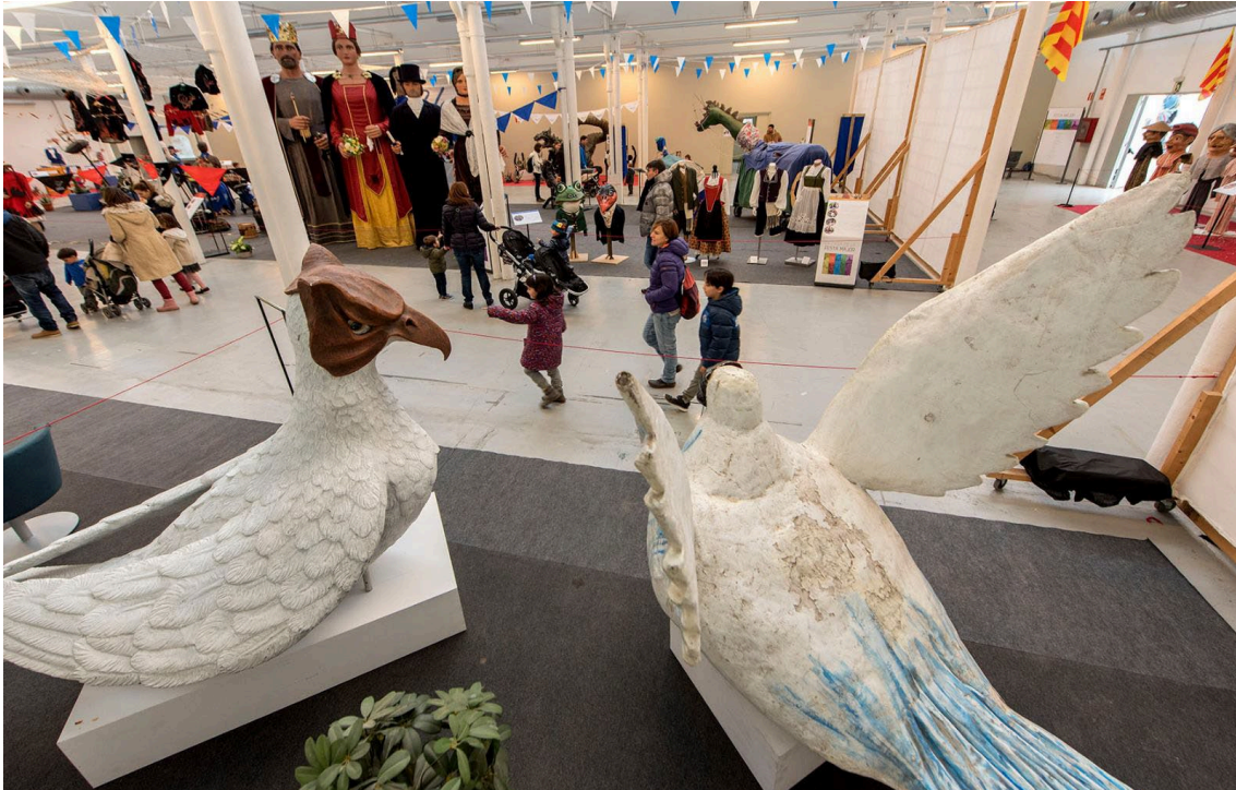
The facility showcases characteristic elements of the city's popular culture.

Technology Regional Network of Catalonia, related to heritage and industrial tourism, or the Trans Europe Halles network.