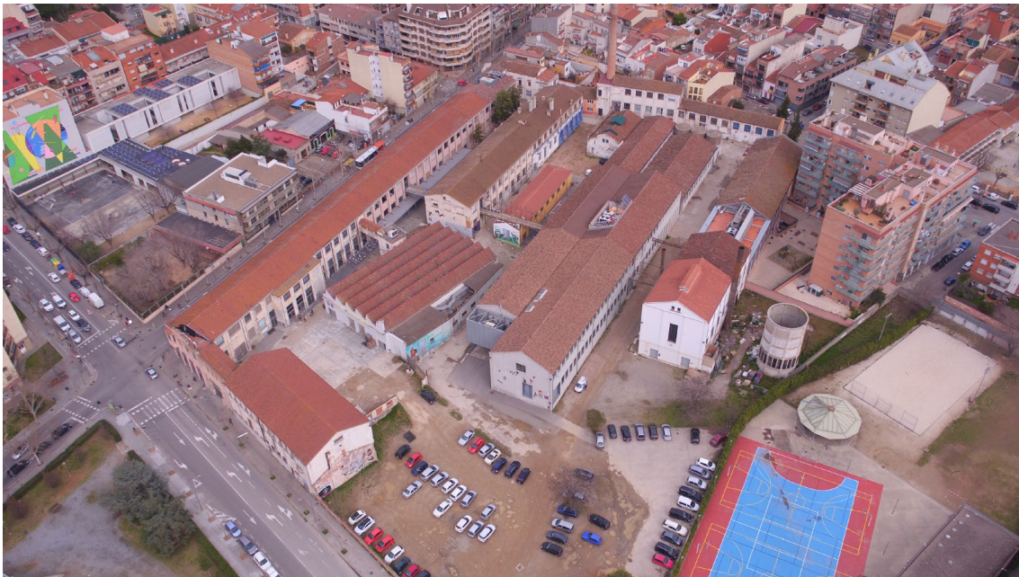
Aerial view of the Factory

Granollers is a city of education, defending diverse, quality learning that helps all people grow. Bombings during the 1938 Spanish Civil War was a turning point for Granollers, which thereafter promoted a culture of peace both locally and internationally. The city is small and welcoming. This has made it easier to preserve natural spaces, ensure agricultural production, and expand pedestrian areas that promote citizen life. Creating this model has been possible because of living associative networks, which energize the city and political leadership through decisive long-term visions.