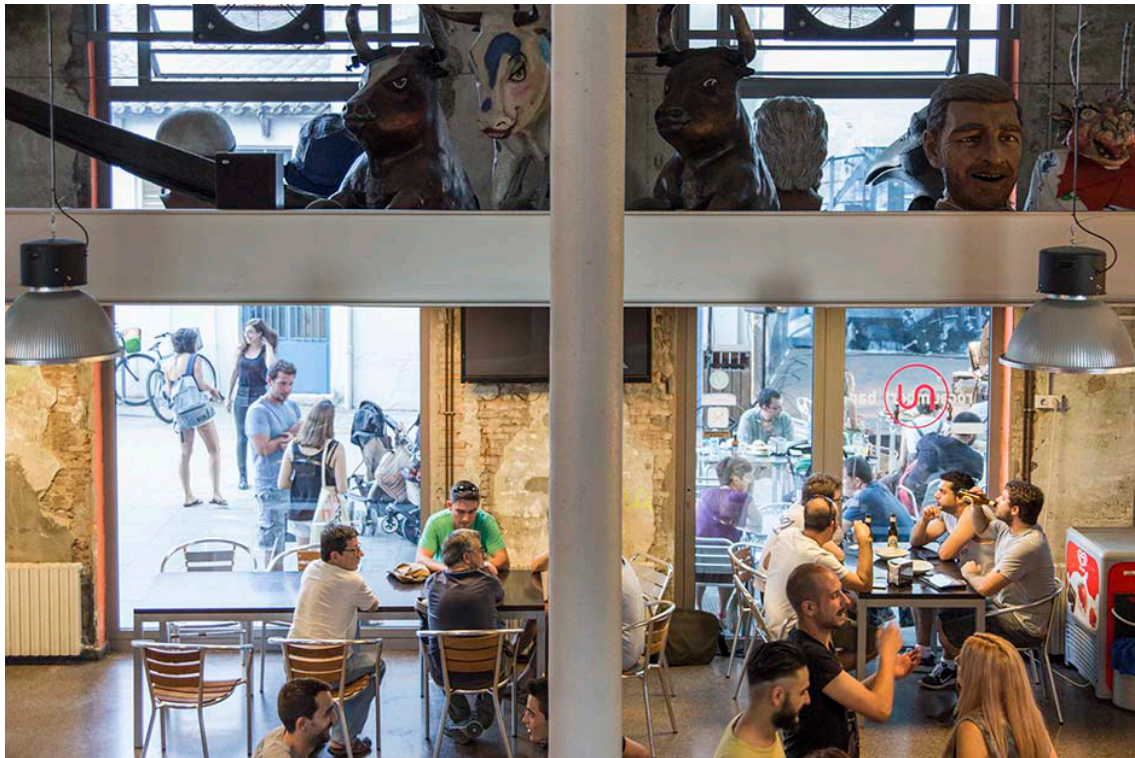
Showcasing festival figures in the bar.

teaches and constructs culture ". Additionally, the project promotes cultural rights, plurality, innovation, and creativity as tools for economic development and social transformation, as detailed in the city's Strategic Plan II.